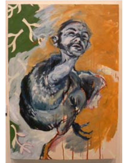
Sal Higgens Migrant Species (HUW as Ba) Huw Williams 1000 x 700mm