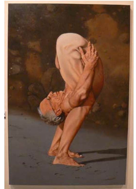
Peter Miller Looking for the Origin of the World (Homage to Courbet) 1800 x 1150mm