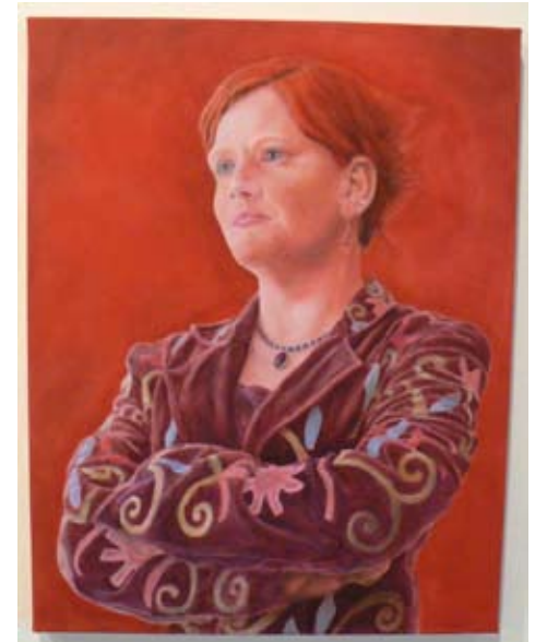
Hideo Irie Bonnie 700 x 550mm